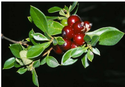
GJ Coprosma hirtella

shrub to 3 m; large clusters of small white flowers