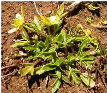
GJ Ranunculus nanus

tufted buttercup rosette herb; leaves erect, divided several times; flowers white/yellow, single