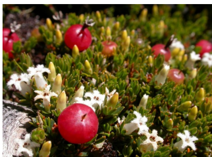
RS Pentachondra pumila

forest frillyheath shrub to 40cm; leaves elliptical to 2cm; flowers white, petals hairy inside, clustered in small groups at ends of branches