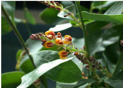
GJ Daviesia latifolia

Correa lawrenceana var. lawrenceana mountain correa shrub/small tree to 4m, branches hairy; flowers green/yellow, tubular to 3cm long