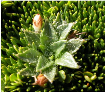
GJ Plantago gunnii

tree to 8m, conical habit; leaves dark green above, lighter below; flowers bell-shaped, brown & yellow