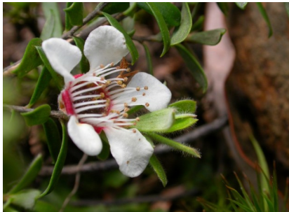
RS Leptospermum lanigerum

upright shrub/tree to 8m; leaves grey-green to 2cm; flowers white with red centres; fruit small, reddish, leathery