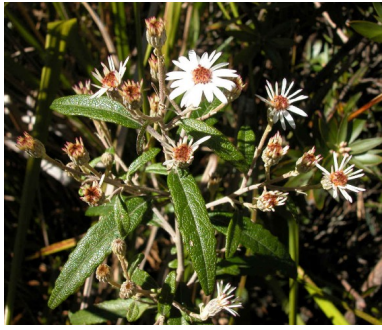
GJ Olearia phlogopappa

dusty daisybush shrub to 1.5m; leaves hairy under, margins somewhat toothed; white daisy flowers to 2 cm diam.