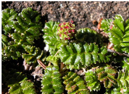
GJ Acaena montana

subsp. mucronata caterpillar wattle erect shrub/small tree; leaves narrow linear to 15cm long with short narrow point; yellow flowers in spikes