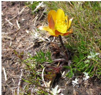
RS Ranunculus gunnianus

mountain buttercup perennial prostrate herb of wet subalpine areas, spreads by rooting of stems; flowers single, yellow on stem above rosette