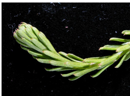
GJ Phyllota diffusa

carpet frillyheath prostrate mat forming shrub; leaves oblong to 4mm long; flowers tubular, white; fruit red