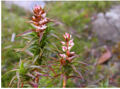
RS Richea gunnii

bog candleheath shrub to 1m; leaves at ends of branches, curved down, to 4cm long, sharp; flowers white