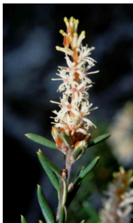
GJ Orites revolutus

yellow orites shrub to 1.5m; leaves cylindrical, yellowish, sharp-pointed; flowers creamy white