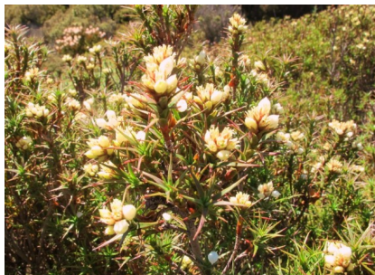
RS Richea acerosa

dwarf buttercup rosette herb. leaves with three lobes; flowers golden on long stems, to 15mm diam.