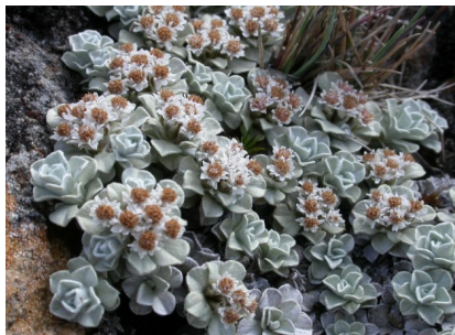
RS Ewartia catipes

shiny striped eyebright perennial herb to 30cm, stems often purple; leaves with toothed ends; flowers white/mauve, lobes with purple lines