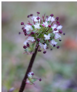
GJ Acaena x anserovina

common buzzy herb; leaves divided; balls of flower/seeds with hooks