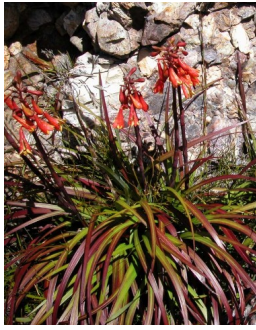
GJ Blandfordia punicea