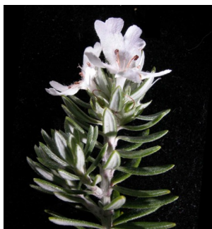
GJ Westringia brevifolia

thymeleaf purpleberry shrub to 1.5m; leaves 2-4mm long, crowded; flowers pink/white in spikes; fruit fleshy, mauve/purple