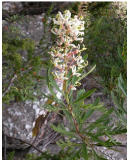
GJ Lomatia tinctoria

alpine marshwort small herb often forming submerged patches in subalpine tarns; leaves fleshy; flowers small white