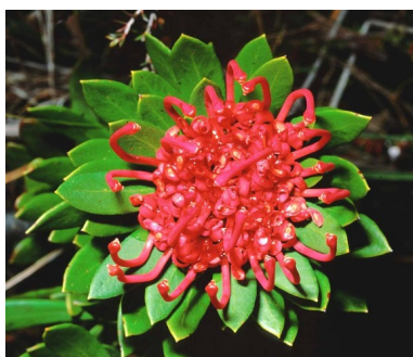
GJ Telopea truncata

tasmanian waratah tree to 4m; leaves lance-shaped; flowers red, to 8cm diam; fruit a leathery pod