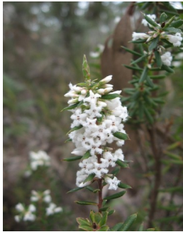
BC Leucopogon collinus

common teatree shrub to 4m; leaves to 2cm with prickly pointed tips; flowers white; fruit with 5 slits, top convex, woody