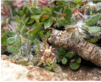
GJ Xanthosia ternifolia

shrubby crossherb small shrub; leaves 3-lobed, hairy; flowers tiny, in groups