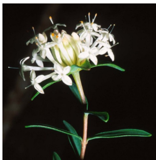
GJ Pimelea linifolia

heath bushpea spreading shrub to 20cm tall; leaves cylindrical, linear, tightly rolled under; yellow pea flowers with red markings