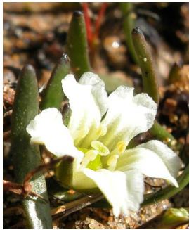
GJ Liparophyllum gunnii

trailing beardheath shrub to 30cm, branches spreading, hairy; leaves narrow, pointed ends, edges turned up; flowers hairy inside