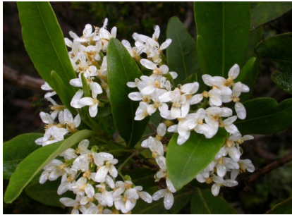
RS Olearia tasmanica

prickly daisybush shrub to 3m; leaves rigid, linear, sharp pointed, to 4cm; white daisy flowers on fine stalks, up to 6 "petals"