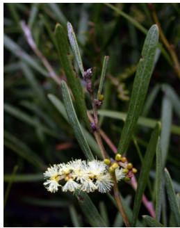
RW Acacia mucronata

blackwood tree to 30m; leaves with parallel veins; round flower heads