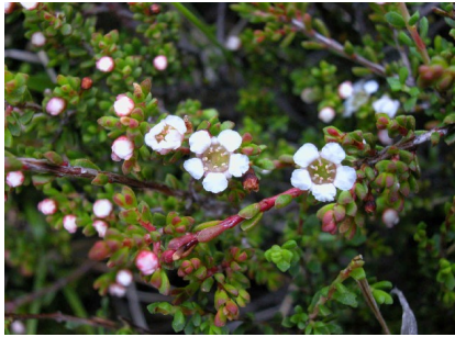
GJ Baeckea gunniana

heartberry straggling shrub to 1.5m; leaves to 70mm, lance-shaped, edges serrated; flowers white, bell-shaped, petals three-toothed; fruit heart shaped, white, red or black