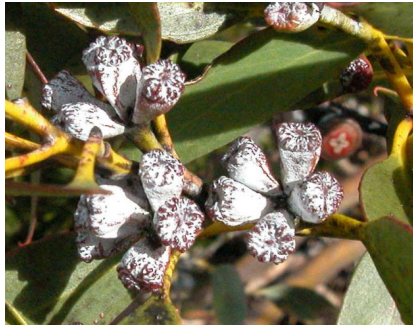
GJ Eucalyptus coccifera

snow peppermint tree 9-30m tall; adult leaves lance-shaped with hooked tip