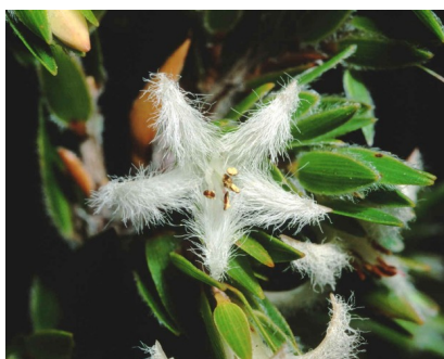
GJ Pentachondra involucreta

forest frillyheath shrub to 40cm; leaves elliptical to 2cm; flowers white, petals hairy inside, clustered in small groups at ends of branches