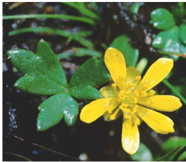
GJ Ranunculus collinus

prickly beauty shrub to 2.5m; leaves to 12mm, sharp pointed; golden pea flowers at ends of branches