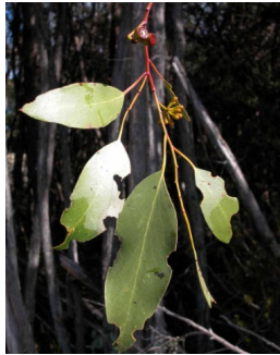
GJ Eucalyptus delegatensis

snow peppermint tree 9-30m tall; adult leaves lance-shaped with hooked tip