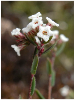
GJ Leucopogon pilifer

white beardheath shrub to 50cm; leaves with edges turned down; flowers tiny, tubular, bearded inside, in clusters at ends of branches