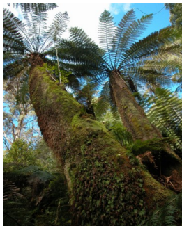
GJ Dicksonia antarctica

hard waterfern fronds dark green, divided only once, fertile fronds different