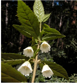
GJ Aristotelia peduncularis

heartberry straggling shrub to 1.5m; leaves to 70mm, lance-shaped, edges serrated; flowers white, bell-shaped, petals three-toothed; fruit heart shaped, white, red or black