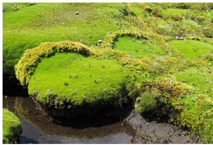
RS Abrotanella forsteroides

celerytop pine conifer tree to 20m; "leaves" diamond shaped, thick, often lobed; female flowers fleshy in groups attached to "leaves", white & red