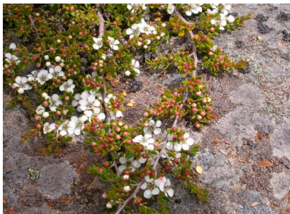
RS Leptospermum rupestre

shrub or small tree; leaves hairy; flowers white, hairy at base; fruit hairy at base