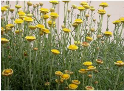
RS Coronidium scorpioides

mountain currant shrub to 2m; leaves small elliptical; flowers small; fruit spherical, orange/red