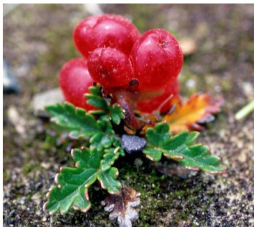
GJ Rubus gunnianus

rigid candleheath shrub to 40cm; leaves to 13cm, sharply pointed; flowers yellow at ends of branches