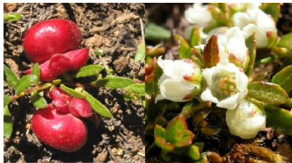
GJ Gaultheria tasmanica

copperleaf snowberry shrub to 1m; leaves dark green, edges serrated; flowers urn shaped, white/pink; fruit white, fleshy