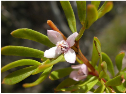
GJ Boronia pilosa

lily-like herb; leaves strap-like to 1.5m; flowers tubular, red/orange externally yellow internally to 45mm long