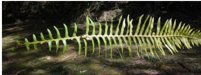
GJ Blechnum nudum

quartzite paperdaisy herb to 20cm high; leaves 2-5cm long, hairy; daisy flower heads solitary, to 4cm diam, white with yellow centre