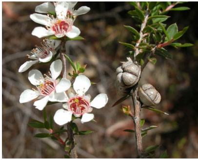
GJ Leptospermum scoparium

common teatree shrub to 4m; leaves to 2cm with prickly pointed tips; flowers white; fruit with 5 slits, top convex, woody