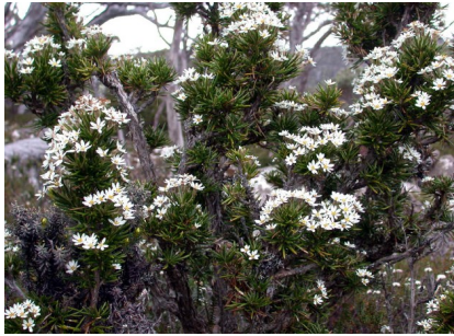
RW Olearia pinifolia

dusty daisybush shrub to 1.5m; leaves hairy under, margins somewhat toothed; white daisy flowers to 2 cm diam.