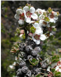
GJ Leptospermum glaucescens

prostrate shrub spreading to 30cm; leaves to 2cm long, edges rolled under; flowers large, yellow very numerous