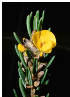
GJ Aotus ericoides

broom spurge almost leafless with angles stems, forms clumps resembling grass tussock