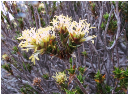
RS Richea sprengelioides

scoparia shrub to >1m; leaf to 6cm, sharp pointed; flowers in long dense spikes, white/pink/red