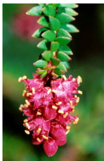
GJ Trochocarpa thymifolia

spreading pinkbells prostrate shrub to 20cm high; leaves narrow, margins rolled under, to 8mm; flowers white to mauve/pink. centres dark purple