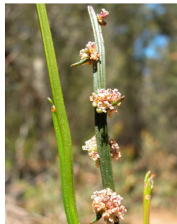
GJ Amperea xiphioclada

wiry bushpea shrub to 90 cm; leaves oblong to 8 mm; yellow/orange pea flowers in bunches at ends of stems