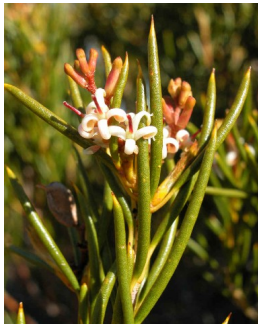
GJ Orites acicularis

tasmanian daisybush shrub to 3m; leaves elliptical to 5cm, shiny above, white & hairy below; white daisy flower heads 3 to 5 on single stem