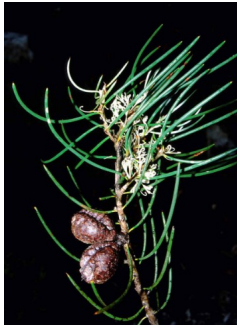
GJ Hakea lissosperma