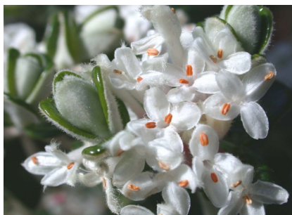
RW Pimelea nivea

bushmans bootlace shrub to 2m; leaves round, dark green, shiny above, white & hairy below; flowers tubular, in spherical heads