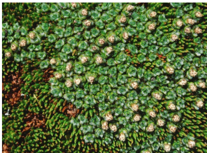
GJ Pterygopappus lawrencei

shrub/tree to 10 m; leaves to 10 cm with deep veins, white under; flowers cream/green in branched clusters.