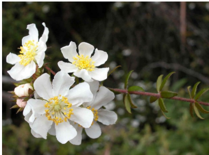
GJ Bauera rubioides

silver banksia tree with typical banksia cones or yellow flower spikes