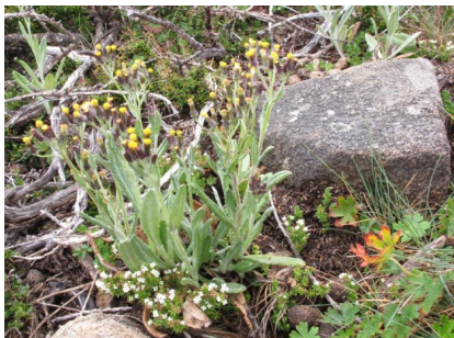
RS Senecio gunnii

alpine raspberry prostrate alpine herb, spreads by rhizomes; leaves dark green, three serrated leaflets; flowers white on short stalks; fruit red