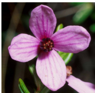
GJ Tetratheca pilosa

tasmanian waratah tree to 4m; leaves lance-shaped; flowers red, to 8cm diam; fruit a leathery pod