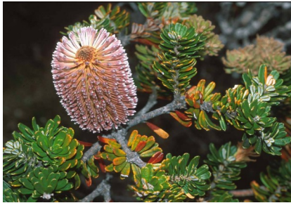
GJ Banksia marginata

alpine heathmyrtle shrub to 2m; leaves to 5mm, oblong; flowers 5mm diam; white petals, red centre