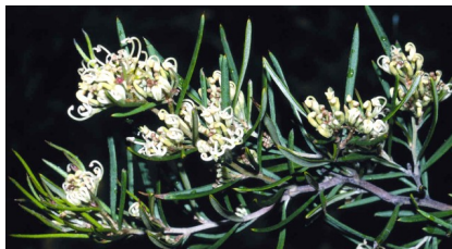
GJ Grevillea australis

hop native-primrose shrub to 2m; leaves bright green, to 6cm, edges toothed; flowers yellow with petals in two groups