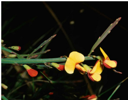
GJ Bossiaea riparia

shrub to 1m; leaves divided with 3-7 leaflets; flowers white to pink with four petals