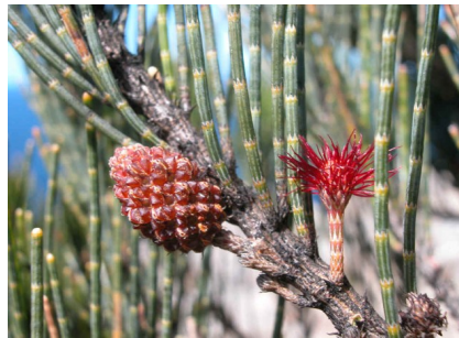
GJ Allocasuarina monilifera

snow beardheath shrub to 60m; blunt leaves to 10mm; white flowers hairless inside