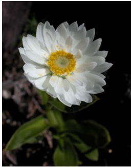
GJ Xerochrysum collierianum

shrubby crossherb small shrub; leaves 3-lobed, hairy; flowers tiny, in groups