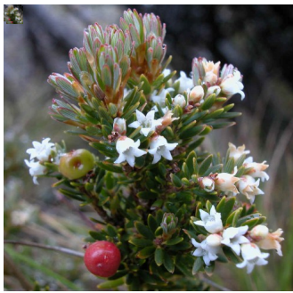
GJ Acrothamnus montanus

snow beardheath shrub to 60m; blunt leaves to 10mm; white flowers hairless inside