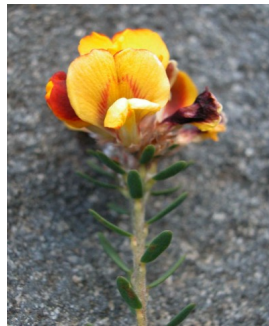
GJ Almaleea subumbellata

necklace sheoak shrub to 4m; leaves like tiny teeth around joints in neele-like branchlets; fruit, cylindrical cones with pointed ends