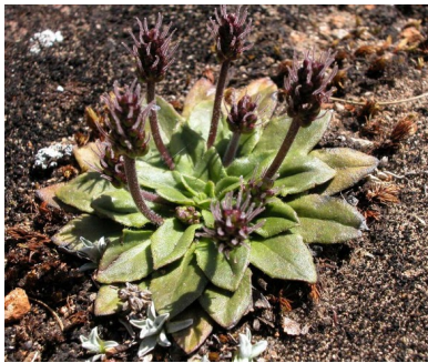
GJ Plantago tasmanica

small herb; always grows in cushion plants; leaves ca. 1cm long in a rosette; flowers in a cluster on short stalk