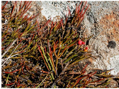
GJ Exocarpos humifusus

mountain native-cherry prostrate shrub; leaf scales alternate; tiny flowers in groups; fruit dark red