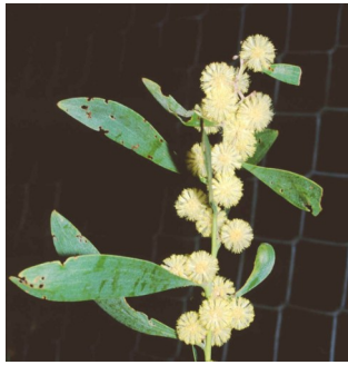
GJ Acacia melanoxylon

blackwood tree to 30m; leaves with parallel veins; round flower heads