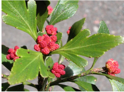
GJ Phyllocladus aspleniifolius

celerytop pine conifer tree to 20m; "leaves" diamond shaped, thick, often lobed; female flowers fleshy in groups attached to "leaves", white & red