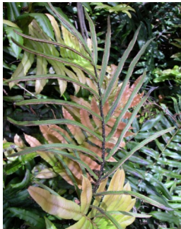
GJ Blechnum wattsii

fishbone waterfern fronds light green divided only once, fertile fronds different