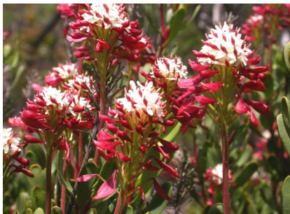
RS Bellendena montana

wiry bauera sprawling wiry shrub; leaves opposite, each with three leaflets; flowers white to pink