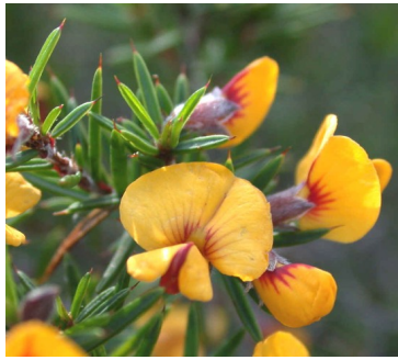
RW Pultenaea juniperina

prickly beauty shrub to 2.5m; leaves to 12mm, sharp pointed; golden pea flowers at ends of branches