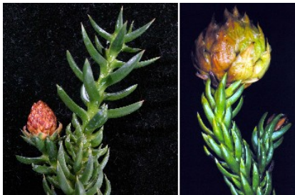
GJ Athrotaxis selaginoides

pencil pine conifer to 20m high; bark fibrous, furrowed; leaves small, overlapping; cones spherical