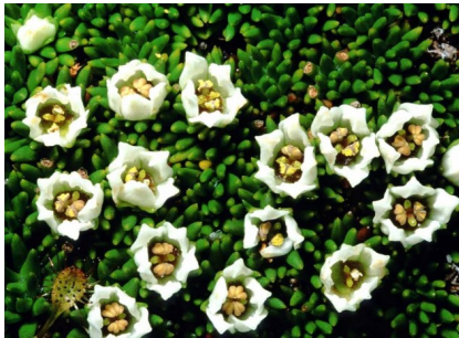
GJ Donatia novae-zelandiae

shrub to 3m; leaves pointed, to 5cm, green above whitish below; flowers tubular, white; fruit fleshy, white to red