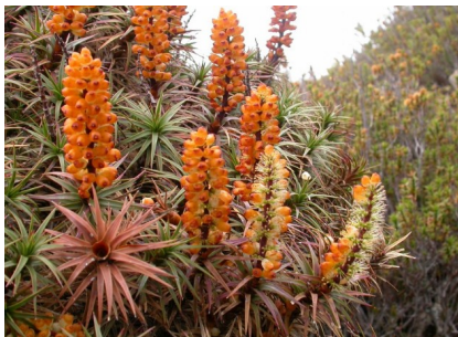
RS Richea scoparia

heath to 10m high; leaves strap-like, to 2m long; flowers white/pink maturing to deep pink, in spike to 25cm long