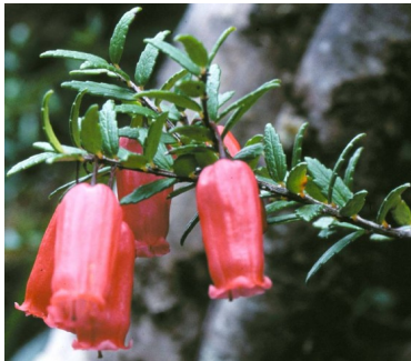
GJ Prionotes cerinthoides

grooved cheeseberry shrub to 40cm high; leaves crowded, to 1cm long, margins rolled under; flowers white, tubular; fruit a flattened, red drupe