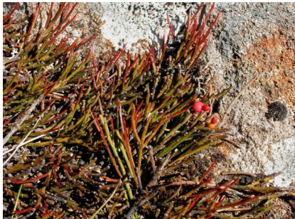
GJ Exocarpos humifusus

creeping cushionherb creeping rosette herb; leaves white woolly; flower heads above rosette