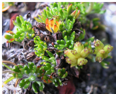
GJ Actinotus moorei

mountain beardheath shrub to 60 cm; leaves blunt, to 10mm; white flowers hairy inside