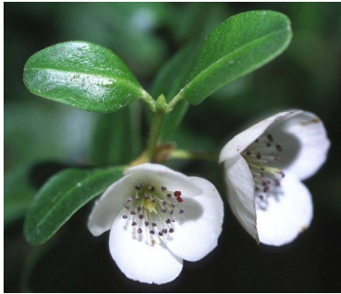
GJ Eucryphia milliganii

leatherwood tree to 12m; leaves green above whitish below, ends blunt; flowers with 4 rounded white petals & numerous reddish stamens