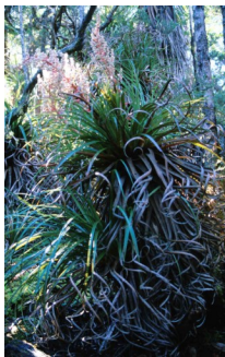
GJ Dracophyllum milliganii

alpine cushion plant in western and central mountains; leaves hairy at base; flowers white, petals 5, each 5mm long