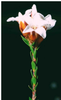
GJ Epacris corymbiflora

alpine sundew carnivorous rosette herb; leaves elongated; single white flower