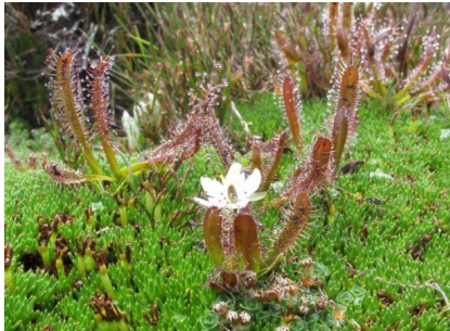
RS Drosera arcturi

heath cushionplant alpine cushion plant to 90cm diam; leaves hard pointed, hairless; flowers white, tubular