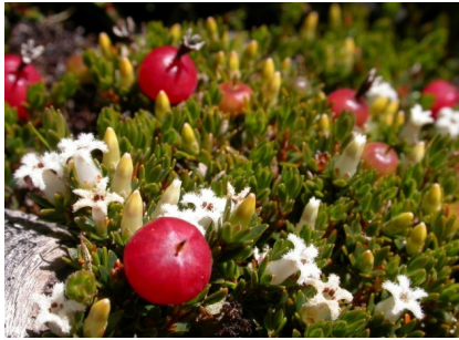
RS Pentachondra pumila

alpine everlastingbush shrub to 1m; leaves to 1.5cm, grey-green, hairy/white below; flowers white, clustered at ends of branches