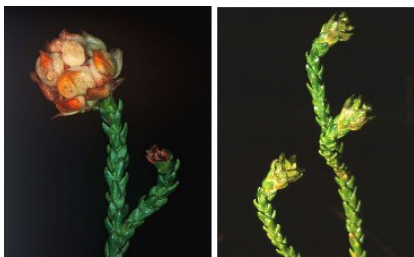
GJ Athrotaxis x laxifolia

king billy pine conifer to 40m high; leaves to 12mm long, loosely overlapping; cones spherical to 2cm diam