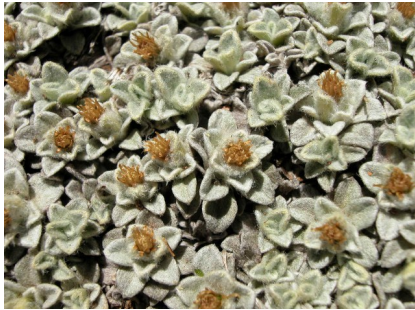
GJ Ewartia planchonii

rusty cushionherb herb forming cushion-like mats; leaves to 5mm long, woolly white; flower heads single, white with reddish centre