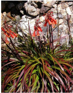
GJ Blandfordia punicea

shrub to 1m; leaves to 4cm, variable shape; flowers white in broad spikes; fruit flat, bright red