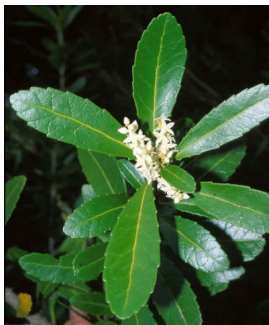
GJ Cenarrhenes nitida

perennial herb; leaves silver-hairy, overlapping, to 3cm long; flower heads white with yellow centres, on long stems