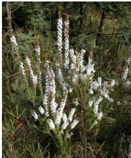
GJ Epacris gunnii

buttongrass heath shrub to 75cm high; leaves to 7mm long, thick, elliptical, appressed to stem; flowers white, tubular, sepals brown,