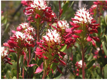
RS Bellendena montana