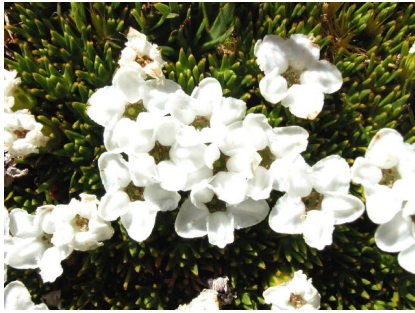
GJ Dracophyllum minimum

heath cushionplant alpine cushion plant to 90cm diam; leaves hard pointed, hairless; flowers white, tubular