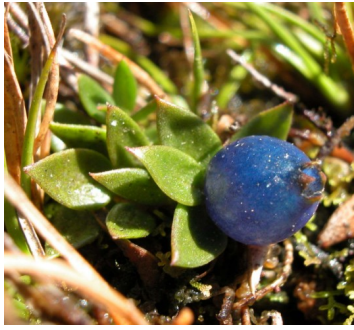
GJ Coprosma moorei