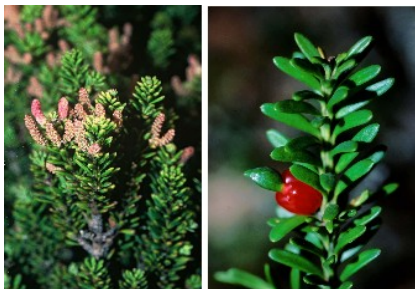
GJ Podocarpus lawrencei

celerytop pine conifer tree to 20m; "leaves" diamond shaped, thick, often lobed; female flowers fleshy in groups attached to "leaves", white & red