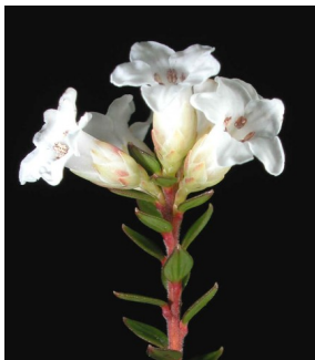
GJ Epacris serpyllifolia

coral heath shrub to 80 cm; leaves heart shaped, prickly; white tube flowers