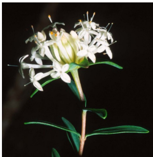
GJ Pimelea linifolia

grey riceflower shrub to 2m high; leaves opposite, elliptical, to 3cm long, flat; flowers white, tubular, in few-flowered, terminal heads