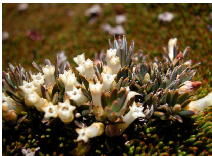
GJ Montitega dealbata

mountain broomheath shrub to 3m; leaves to 12mm, elliptic, apex blunt, green above, white branched veins under; flowers white tubular