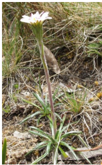
RS Celmisia asteliifolia

lily-like herb; leaves strap-like to 1.5m; flowers tubular, red/orange externally yellow internally to 45mm long