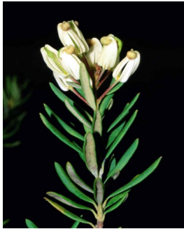
GJ Lomatia polymorpha

dwarf marshwort tiny herb, forms tangled masses; leaves elliptical/round, to 6mm long; flowers tiny, yellow, on slim stems