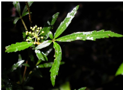
GJ Pseudopanax gunnii

climbing heath climbing shrub to 10m high; leaves to 14mm long, oblong, margins serrated; flowers pink/red, tubular, to 25mm long