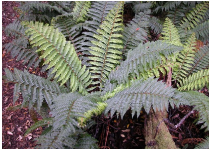
GJ Polystichum proliferum

mother shieldfern note bulbils (new FERN) on fronds