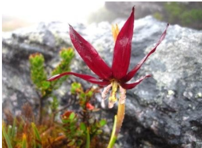
MG Isophysis tasmanica

cutting grass tufted perennial with narrow grass-like leaves with sharp, rough edges; flowers in spikes on culms to 3m