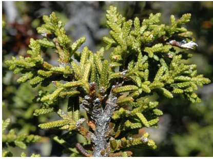
RW Diselma archeri

dwarf pine shrub to 1.5m high; leaves small, crowded, overlapping, appressed to stems; cones appear to be bulges at ends of branches