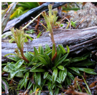
GJ Abrotanella scapigera