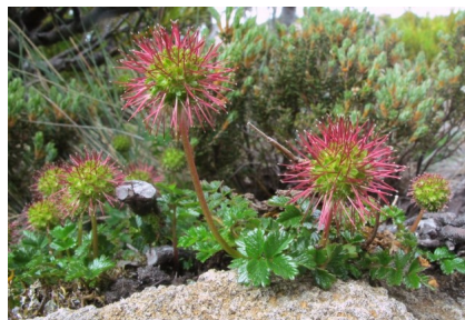
RS Acaena novae-zelandiae

mountain buzzy prostrate herb; spherical flower/seed heads with hooks