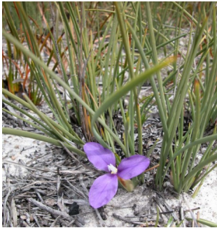
GJ Patersonia fragilis

lily to 75cm high, growing in dense colonies; leaves strap-like, to 50cm long; flowers cream/white, tubular, hairy, in groups at ends of stems