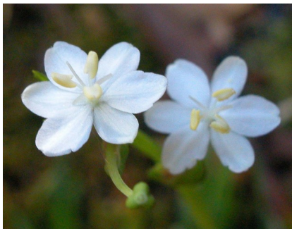
GJ Libertia pulchella

tasmanian purplestar herb to 30cm high; leaves tapered, in fan-shaped tufts, flowers purple, star-shaped, on stem longer than leaves