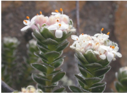
RS Pimelea sericea

mountain riceflower shrub to 70 cm; leaves hairy below, to 12 mm long; flowers white to pink, in heads