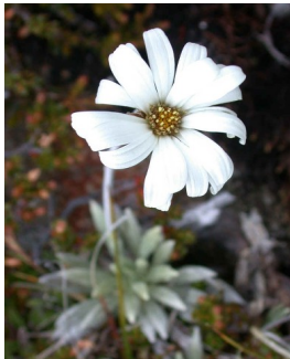
RW Celmisia saxifraga

rosette herb to 30cm; leaves to 15cm, green above, silver hairy below; single large white daisy flower on long stem