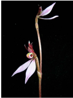
GJ Eriochilus cucullatus

western flag-iris perennial herb; leaves strap-like, to 100cm long, flowers on long stalks, white with yellow & purple centres