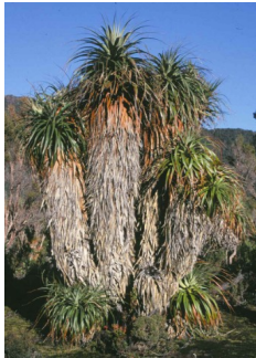
GJ Richea pandanifolia

nodding candleheath shrub to 2m high; leaves narrow, tapering to sharp point, to 6cm long; flowers creamy yellow, pendant, stamens 2cm long