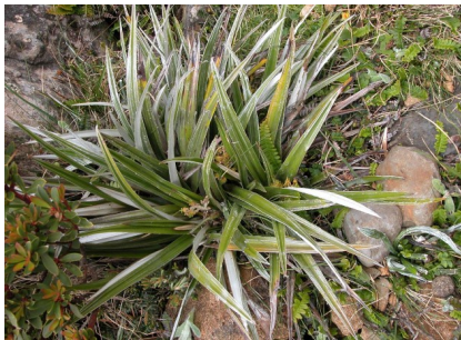
GJ Astelia alpina

subsp. esculentum bracken common fern to 2.5m tall; leathery much divided frond