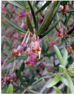
AS Pittosporum bicolor

mountain riceflower shrub to 70 cm; leaves hairy below, to 12 mm long; flowers white to pink, in heads