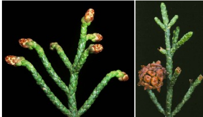
GJ Athrotaxis cupressoides

pencil pine conifer to 20m high; bark fibrous, furrowed; leaves small, overlapping; cones spherical