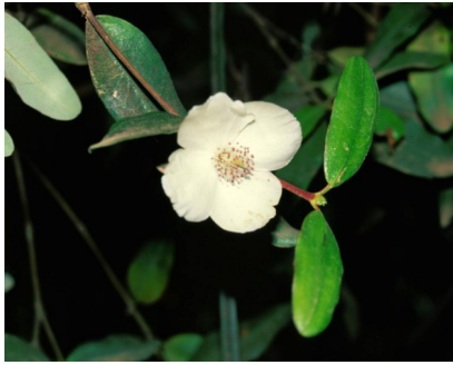
GJ Eucryphia lucida

leatherwood tree to 12m; leaves green above whitish below, ends blunt; flowers with 4 rounded white petals & numerous reddish stamens