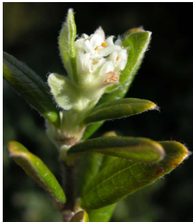
GJ Pimelea cinerea

mountain geebung shrub to 3m high; leaves turned up at blunt end; flowers cream/yellow, tubular, fragrant; fruit green then purple