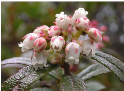
RS Gaultheria hispida

mountain native-cherry prostrate shrub; leaf scales alternate; tiny flowers in groups; fruit dark red