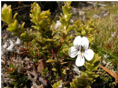
GJ Euphrasia gibbsiae

dwarf leatherwood shrub/small tree to 3m high; leaves opposite, oblong, shiny green above, whitish under; flowers white with numerous showy burgundy-tipped stamens