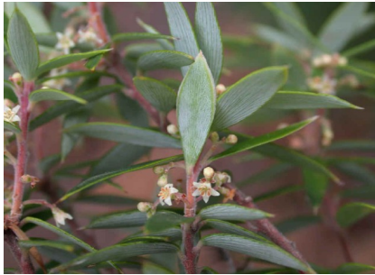
RW Monotoca glauca

mountain guitarplant shrub to 4m high; leaves usually narrow lance-shaped, hairy under; flowers white, in terminal racemes; fruit woody,