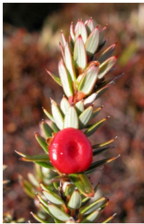
GJ Planocarpa sulcata

cheesewood tree to 8m, conical habit; leaves dark green above, lighter below; flowers bell-shaped, brown & yellow