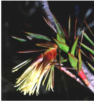
GJ Richea milliganii

sage cushionplant sage-green soft cushion plant; leaves form hexagons with tiny flower at centre