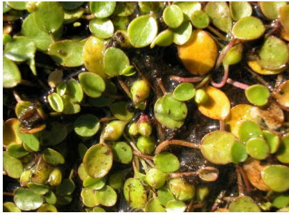
GJ Liparophyllum exiguum

dwarf marshwort tiny herb, forms tangled masses; leaves elliptical/round, to 6mm long; flowers tiny, yellow, on slim stems