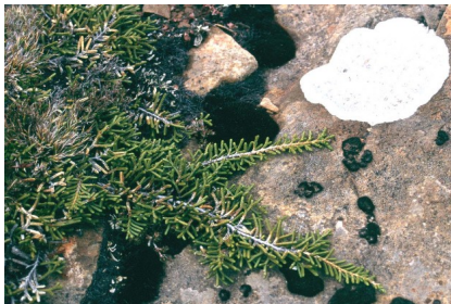
GJ Microcachrys tetragona

huon pine conifer with drooping branches, to 30m high; leaves tiny, overlapping, stem-clasping; cones small