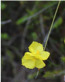
BC Xyris operculata