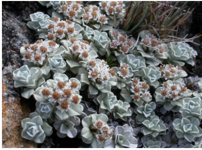
RS Ewartia catipes

diamond cushionherb mat-forming rosette herb; leaves woolly white; flower head pink/white at centre