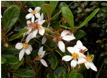
RS Olearia persoonioides

rock daisybush shrub to 60cm; leaves oblong to 3cm, folded down, hairy under; daisy flowers white