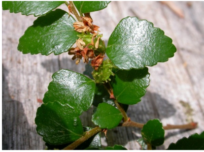
RS Nothofagus cunninghamii

myrtle beech tree to 50m; leaves roundish, new growth red; flowers inconspicuous