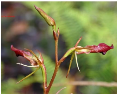
JC Cryptostylis subulata

green mountainlily herb to 30cm high; single basal leaf & smaller stem leaves; flower usually single, green