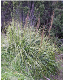
GJ Gahnia grandis

autumn-orchid to 30 cm tall pink flower like a parson's bands