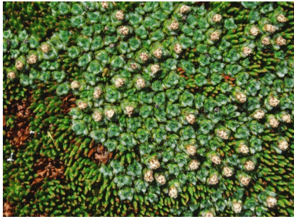
GJ Pterygopappus lawrencei

sage cushionplant sage-green soft cushion plant; leaves form hexagons with tiny flower at centre