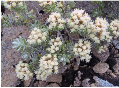
RS Ozothamnus rodwayi

alpine everlastingbush shrub to 1m; leaves to 1.5cm, grey-green, hairy/white below; flowers white, clustered at ends of branches