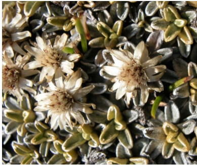
GJ Ewartia meredithiae

diamond cushionherb mat-forming rosette herb; leaves woolly white; flower head pink/white at centre