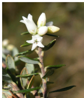
GJ Acrothamnus hookeri

common buzzy herb; leaves divided; balls of flower/seeds with hooks