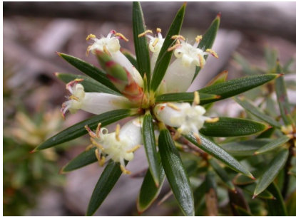
RS Cyathodes glauca

shrub to 2m; leaves small elliptical; flowers small; fruit spherical, orange/red