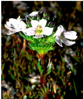
GJ Euphrasia hookeri

striped tufted eyebright herb to 40cm high; opposite, hairy, lobed, wedge-shaped; flowers white, striated, 2 fused upper petals, lower 3 separate