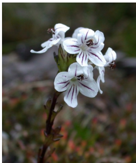
RW Euphrasia striata

fingerleaf eyebright herb to 10cm high; leaves with several, narrow, red-tipped lobes; flowers white with purple stripes, glandular hairy,