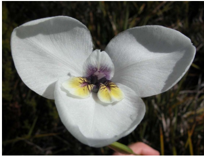
GJ Diplarrena latifolia

western flag-iris perennial herb; leaves strap-like, to 100cm long, flowers on long stalks, white with yellow & purple centres