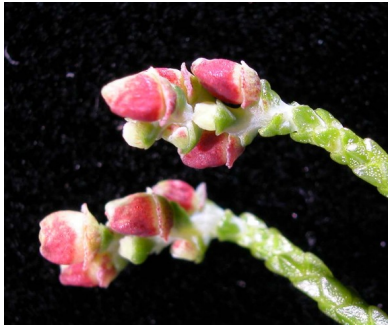
GJ Lagarostrobos franklinii

dwarf pine shrub to 1.5m high; leaves small, crowded, overlapping, appressed to stems; cones appear to be bulges at ends of branches