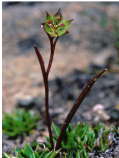
GJ Campynema lineare

var. alpina pineapple grass mat-forming plant; leaves to 40cm; flowers pale yellow; fruit a red berry