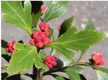
GJ Phyllocladus aspleniifolius

creeping pine prostrate conifer; leaves tiny, appressed to stem; cones small, terminal, red when ripe