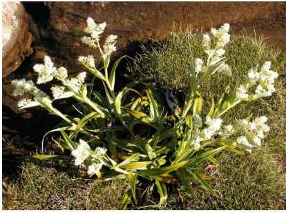
GJ Milligania densiflora