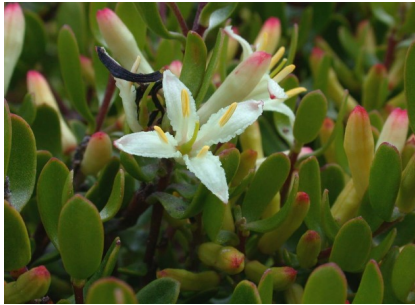
RW Persoonia gunnii

carpet frillyheath prostrate mat forming shrub; leaves oblong to 4mm long; flowers tubular, white; fruit red