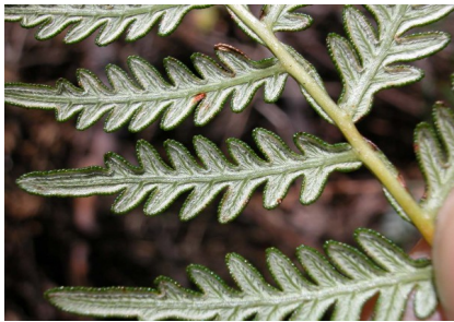
GJ Pteridium esculentum

mother shieldfern note bulbils (new FERN) on fronds