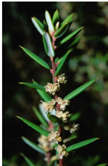
GJ Monotoca submutica

goldey wood shrub to 3m; leaves to 10mm, sharp points; flowers white, 5 petalled, in small groups