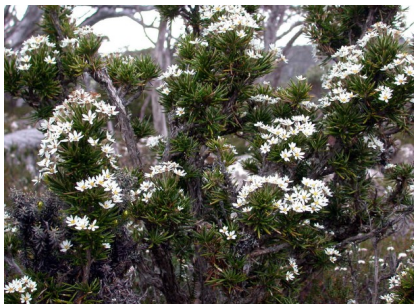
RW Olearia pinifolia

geebung daisybush shrub to 3m; leaves elliptical to 5cm, shiny above, hairy below; flower heads 3 to 5 on single stem