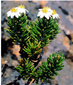
GJ Olearia ledifolia

deciduous beech shrub to 3m high; leaves to 20mm long, rounded with shallow rounded teeth, crinkled, deciduous;