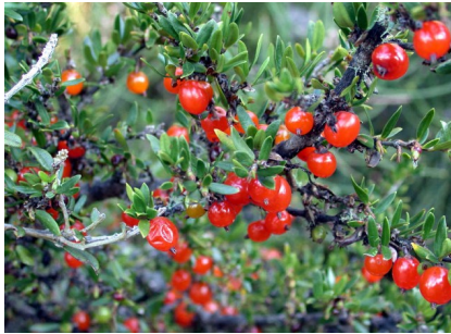
RW Coprosma nitida

shrub, prostrate, to 30cm diam; leaves ovate, thick, shining, to 5mm long; flowers small, bell-shaped; fruit blue, spherical