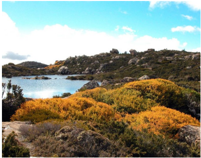
GJ Nothofagus gunnii

myrtle beech tree to 50m; leaves roundish, new growth red; flowers inconspicuous