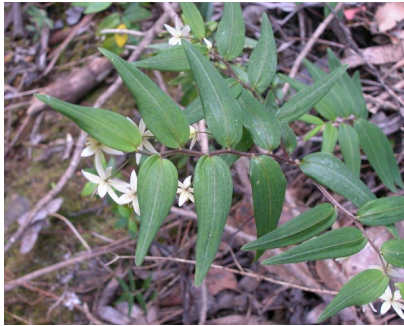
GJ Drymophila cyanocarpa

soft treefern Tall fern, trunks to several metres tall