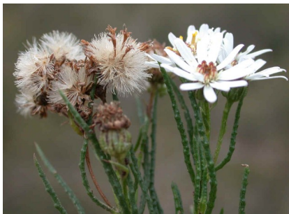
RW Olearia glandulosa

musk daisybush shrub/tree to 15 m; large leaves with silver back; flowers in large crowded heads.