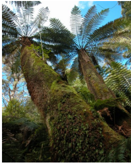
GJ Dicksonia antarctica

soft treefern Tall fern, trunks to several metres tall