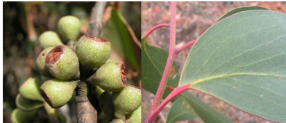
GJ Eucalyptus obliqua

stringybark tree to 90m; trunk & branches covered in soft, ridged bark; leaves very unsymmetrical;