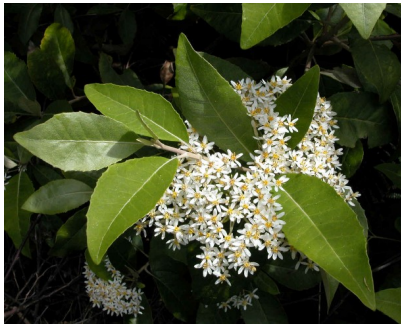
GJ Olearia argophylla

myrtle beech tree to 50m; leaves roundish, new growth red; flowers inconspicuous