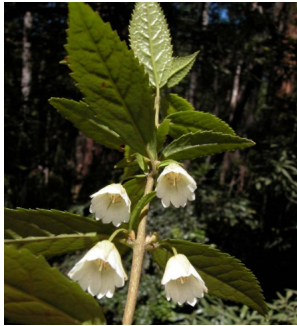
GJ Aristotelia peduncularis

horizontal shrub, or tree to 15m high; trunk usually bends over; leaves opposite, narrow elliptical, to 6cm long; flowers 4-petaled, cream/pale green