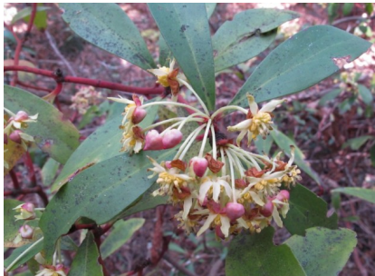
RS Tasmania lanceolata

perennial herb to 2m; leaves narrow linear; yellow daisy flowers in clusters