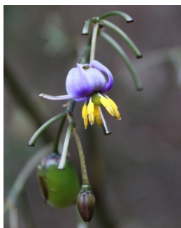
BC Dianella tasmanica

purple cheeseberry shrub to 3m; leaves pointed, to 5cm, green above whitish below; flowers tubular, white; fruit fleshy, white to red