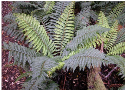
GJ Polystichum proliferum

cheesewood tree to 8m, conical habit; leaves dark green above, lighter below; flowers bell-shaped, brown & yellow