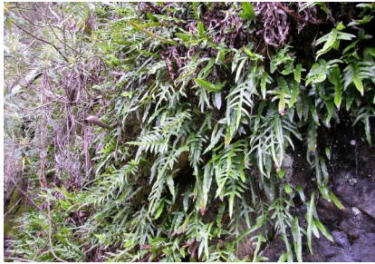
GJ Microsorium pustulatum

scented paperbark shrub/tree to 6m; leaves to 8mm, ovate, pointed; flowers yellow/cream in terminal bottle brushes