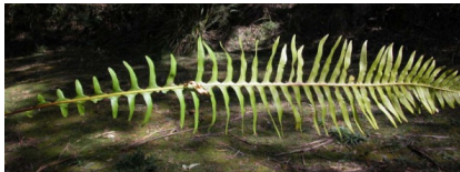
GJ Blechnum nudum

sassafras tree to 25m; leaves to 8cm elliptical, margins often toothed; flowers white, in pairs, pendulous, 4-petaled. Male and female flowers on same or separate trees