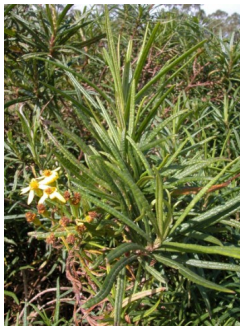
GJ Senecio linearifolius

common fern to 2.5m tall; leathery much divided frond