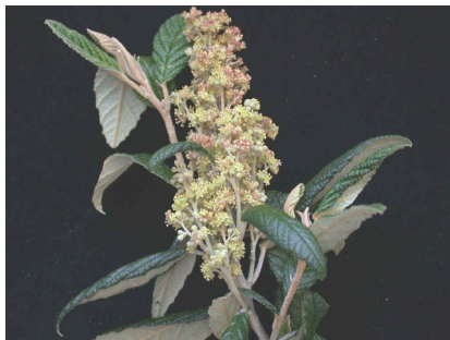
GJ Pomaderris apetala

mother shieldfern note bulbils (new FERN) on fronds