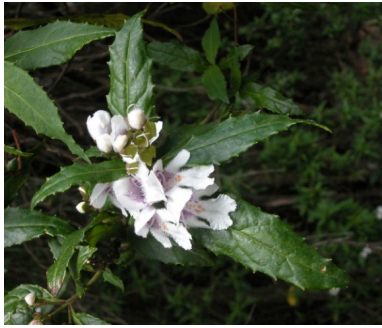
GJ Prostanthera lasianthos