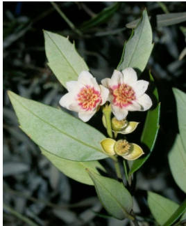
GJ Atherosperma moschatum

heartberry straggling shrub to 1.5m; leaves to 70mm. lance-shaped, edges serrated; flowers white, bell-shaped, petals three- toothed; fruit heart shaped, white, red or black