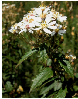
GJ Olearia stellulata

sawleaf daisybush shrub to 3m high; leaves elliptical, 5-9cm long, green above, hairy white under; daisy flower heads numerous, white with yellow centres