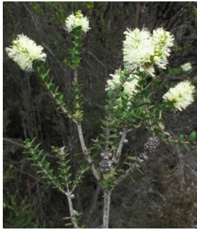
GJ Melaleuca squarrosa

scented paperbark shrub/tree to 6m; leaves to 8mm, ovate, pointed; flowers yellow/cream in terminal bottle brushes