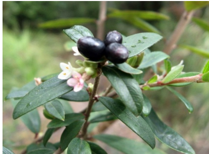
BC Pimelea drupacea

sawleaf daisybush shrub to 3m high; leaves elliptical, 5-9cm long, green above, hairy white under; daisy flower heads numerous, white with yellow centres