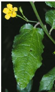
GJ Goodenia ovata

cutting grass tufted perennial with narrow grass-like leaves with sharp, rough edges; flowers in spikes on culms to 3m