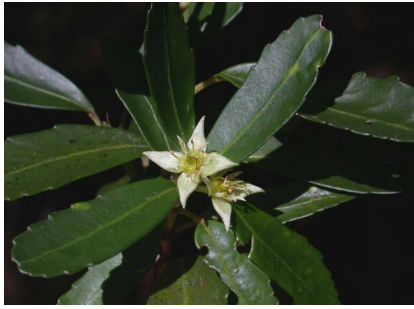
RW Anodopetalum biglandulosum

horizontal shrub, or tree to 15m high; trunk usually bends over; leaves opposite, narrow elliptical, to 6cm long; flowers 4-petaled, cream/pale green