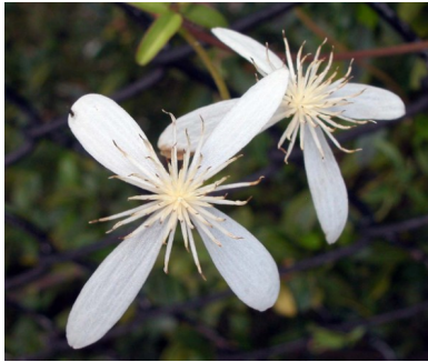
GJ Clematis clitorioides

mountain clematis climber; leaves multi-lobed; large white star-like flowers