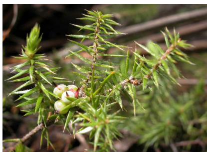
GJ Acrotriche serrulata

herb; leaves divided; balls of flower/seeds with hooks