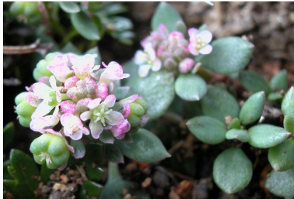
GJ Poranthera microphylla

arrow flatpea scrambling shrub; leaves triangular with sharp tips; flowers orange/yellow pea with bracts that don't conceal the stem.