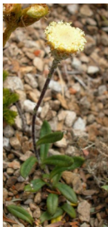
GJ Leptorhynchus squamatus

scaly buttons herb; narrow leaves; solitary daisy flower head on wiry stem to 20 cm tall;