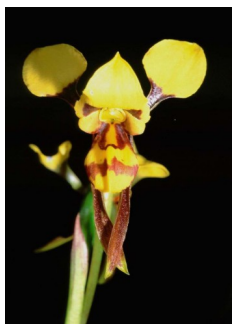
GJ Diuris sulphurea

white flag-iris strap-like leaves; white flowers