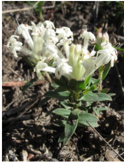
GJ Pimelea humilis

dwarf riceflower dwarf shrub to 20cm tall; white flowers grouped in terminal heads