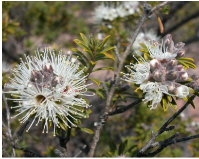
GJ Kunzea ambigua

white kunzea shrub to 4m; masses of white flowers; leaves narrow, tufted