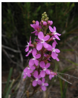
BC Styliidium graminifolium

forest candles herb to 50cm. several erect stems; leaves narrow; flowers white tubular in dense spikes at ends of stems.