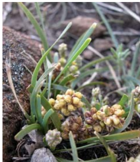
GJ Lomandra nana

sagg tussock of strap-like leaves with notched ends; flowers in spiny clusters