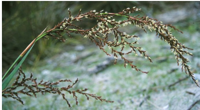
GJ Lepidosperma ensiforme

white kunzea shrub to 4m; masses of white flowers; leaves narrow, tufted