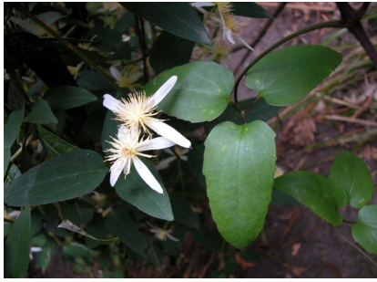
GJ Clematis aristata

mountain clematis climber; leaves multi-lobed; large white star-like flowers