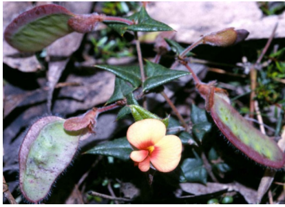
GJ Platylobium triangulare

dwarf riceflower dwarf shrub to 20cm tall; white flowers grouped in terminal heads