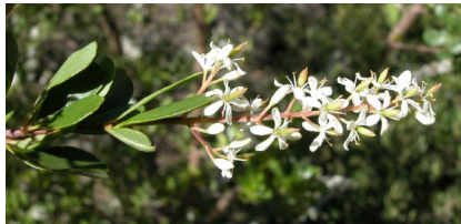
GJ Bursaria spinosa

herb; leaves grass-like; white 6-petalled flowers with maroon centres