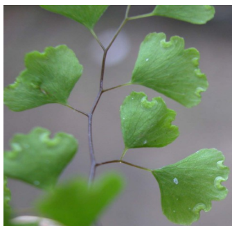
GJ Adiantum aethiopicum

dark green low shrub; prickly leaves; flowers underneath