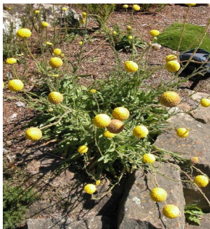
GJ Craspedia glauca

blue lovecreeper wiry climber; small leaves; blue flowers along stems