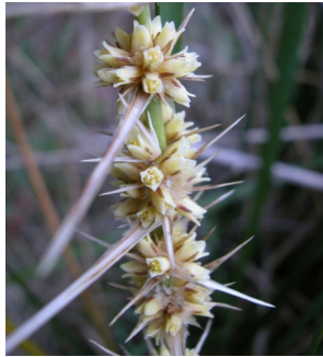
GJ Lomandra longifolia

native flax herb; slender stem to 50 cm tall; blue flowers 2 cm diam. on long stems