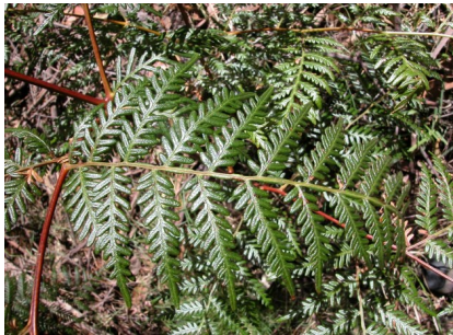
GJ Pteridium esculentum

small poranthera small annual herb; leaves sparse, less than 1 cm; flower heads surrounded by leafy bracts