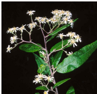
GJ Olearia lirata

forest daisybush shrub to 5m; numerous white daisy flowers at ends of branches