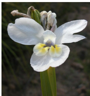
GJ Diplarrena moraea

forest flaxlily perennial to 1.5m; leaves long, narrow, margins serrated; flowers on long stalks, 6-petalled, blue; fruit a blue/purple shiny berry