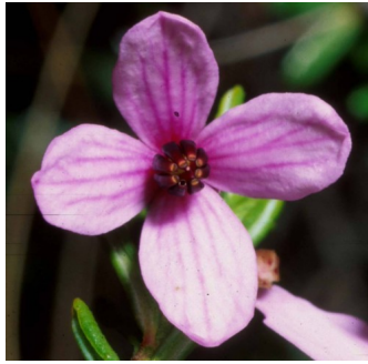
GJ Tetratheca pilosa

hairy pinkbells shrub to 60 cm tall; pink flowers pendulous on stalks