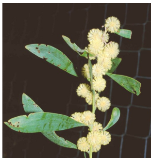
GJ Acacia melanoxylon

spreading wattle shrub; golden flowers in spheres; stiff dagger-like leaves