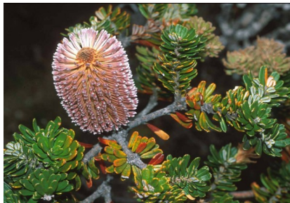
GJ Banksia marginata

silver banksia tree with typical banksia cones or yellow flower spikes