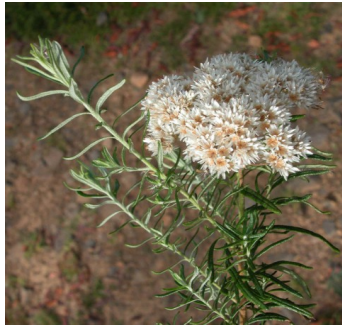
GJ Cassinia aculeata

dolly bush shrub to 3 m; large clusters of small white flowers