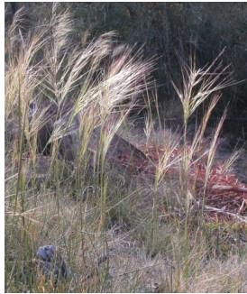
GJ Austrostipa mollis

chocolate lily herb to 90 cm; grass-like leaves; showy purple flowers with chocolate aroma