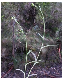
GJ Senecio hispidulus

maroonhood orchid with single green flower with maroon "nose" on stem to 25cm