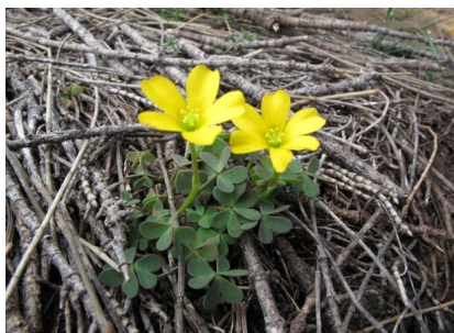
RS Oxalis perennans

forest daisybush shrub to 5m; numerous white daisy flowers at ends of branches