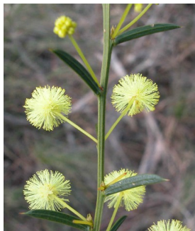
GJ Acacia genistifolia

silver wattle tree with grey green feathery leaves; golden flowers