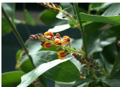
GJ Daviesia latifolia

hop bitterpea shrub; broad leaves with obvious venation; gold & brown pea flowers