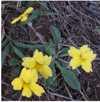
RS Goodenia lanata

trailing native-primrose prostrate herb; leaves to 7cm, dark green above lighter below; flowers golden, asymmetric on long stem