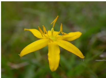
RS Hypoxis hygrometrica

erect guineaflower shrub; narrow leaves; golden 5-petalled flowers