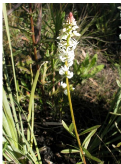
GJ Stackhousia monogyna

rough fireweed herb to 1.25m; leaf with rough upper surface; small flower heads without "petals"