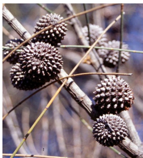
GJ Allocasuarina verticillata