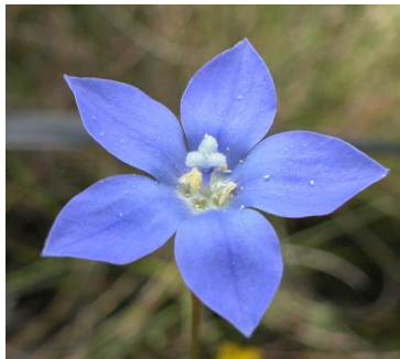
GJ Wahlenbergia gymnoclada

ivy-leaf violet herb; perennial, spreading; kidney shaped leaves; violet flowers on stalks