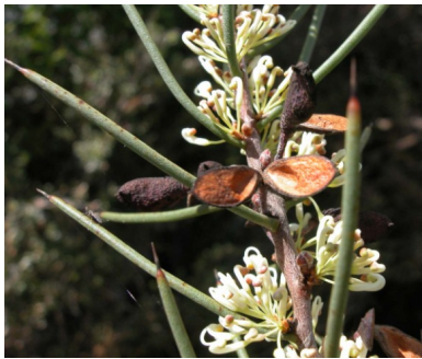
GJ Hakea microcarpa

trailing native-primrose prostrate herb; leaves to 7cm, dark green above lighter below; flowers golden, asymmetric on long stem