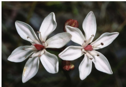
GJ Burchardia umbellata

rosette herb; grey/green leaves; cornflower blue flower heads