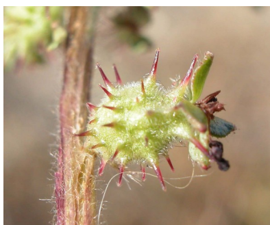
GJ Acaena echinata