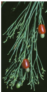
GJ Exocarpos cupressiformis

white gum tree to 50 m, bark rough at base then smooth; leaves green; buds 3