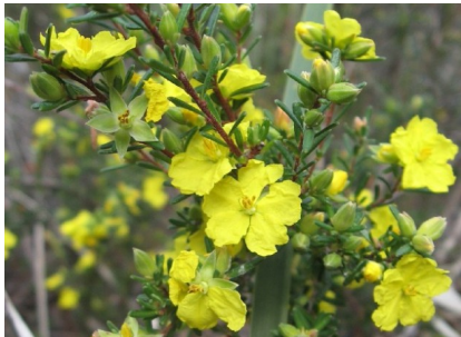
BC Hibbertia riparia

spreading guineaflower prostrate shrub spreading to 30cm; leaves to 2cm long, edges rolled under; flowers large, yellow very numerous