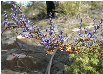
GJ Comesperma volubile

ground clematis herb to 50cm tall; large star-like white flowers