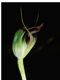
GJ Pterostylis pedunculata

maroonhood orchid with single green flower with maroon "nose" on stem to 25cm