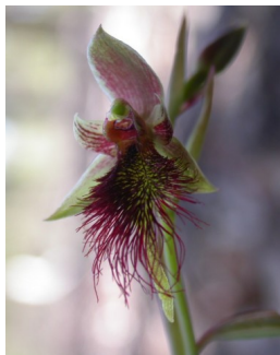
RS Calochilus platychila

small tree; distinctive "purses" (seed cases); white starry flowers