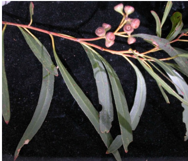
GJ Eucalyptus amygdalina

common heath shrub; white, red or pink tubular flowers with dimples at base