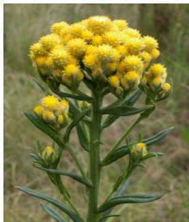
GJ Chrysocephalum semipapposum

threehorned bird-orchid leaves an opposite pair; reddish/brown erect flower to 4cm tall