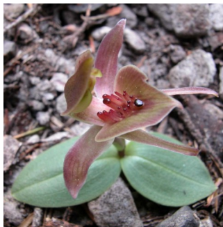
GJ Chiloglottis triceratops

blue stars herb to 25 cm; leaves grass-like; flowers 6-petaled, star-like, blue