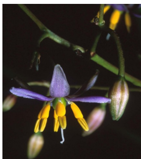
GJ Dianella revoluta

hop bitterpea shrub; broad leaves with obvious venation; gold & brown pea flowers