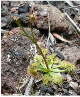
GJ Drosera auriculata

tall sundew herb; fine stem; leaves fringed with glistening hairs