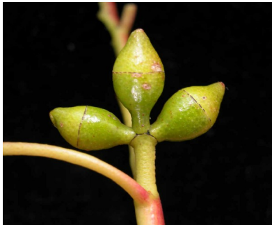
GJ Eucalyptus viminalis

black peppermint tree 15 to 30 m with fine rough bark; leaves narrow; buds 7-15+