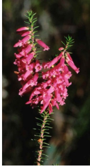
GJ Epacris impressa

tall sundew herb; fine stem; leaves fringed with glistening hairs