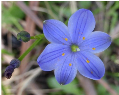
TY Chamaescilla corymbosa

large dodder laurel "monkey twine", parasitic on other plants