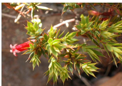
GJ Styphelia humifusa

narrowleaf triggerplant herb to 50cm; leaves narrow, strap-like; flowers pink, four-petaled, in spikes