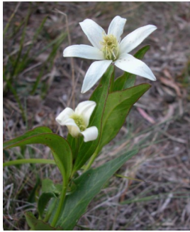
GJ Clematis gentianoides

pleasant clematis woody climber; large white star-like flowers