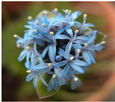
GJ Brunonia australis

herb perennial, to 30cm high; leaves spoon-shaped, to 6cm long; flower head usually mauve, to 4cm diam, on long stalk