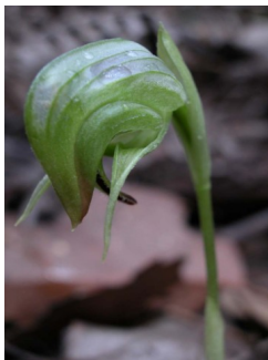
GJ Pterostylis nutans

bracken common fern to 2.5m tall; leathery much divided frond