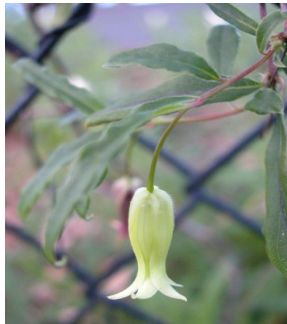
GJ Billardiera mutabilis

silver banksia tree with typical banksia cones or yellow flower spikes