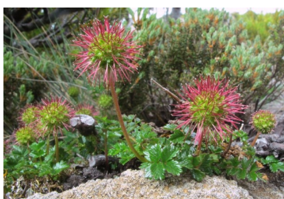
RS Acaena novae-zelandiae