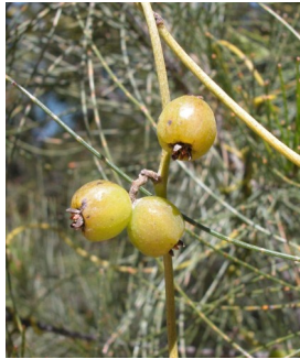
GJ Cassytha melantha

dolly bush shrub to 3 m; large clusters of small white flowers