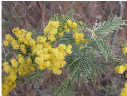
GJ Acacia dealbata

silver wattle tree with grey green feathery leaves; golden flowers