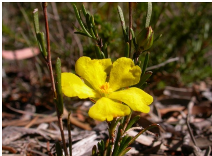
RS Hibbertia procumbens

smallfruit needlebush sharp needle-like leaves, white flowers, small woody fruits