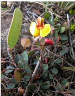
GJ Bossiaea prostrata

green appleberry vine; narrow leaves; yellowish bell-shaped flowers; yellow fruit