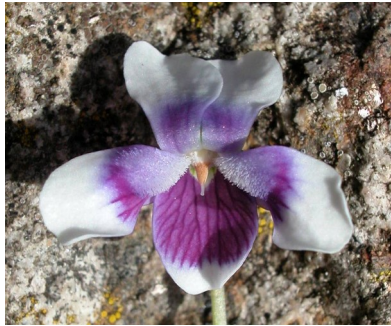
GJ Viola hederacea

hairy pinkbells shrub to 60 cm tall; pink flowers pendulous on stalks