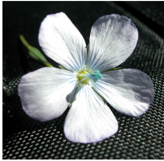
GJ Linum marginale

native flax herb; slender stem to 50 cm tall; blue flowers 2 cm diam. on long stems