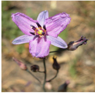
GJ Arthropodium strictum

chocolate lily herb to 90 cm; grass-like leaves; showy purple flowers with chocolate aroma